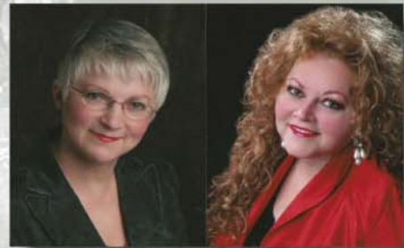
Heartsong Singers for Christ

Monday, August 17 7 PM Boardwalk Bandshell